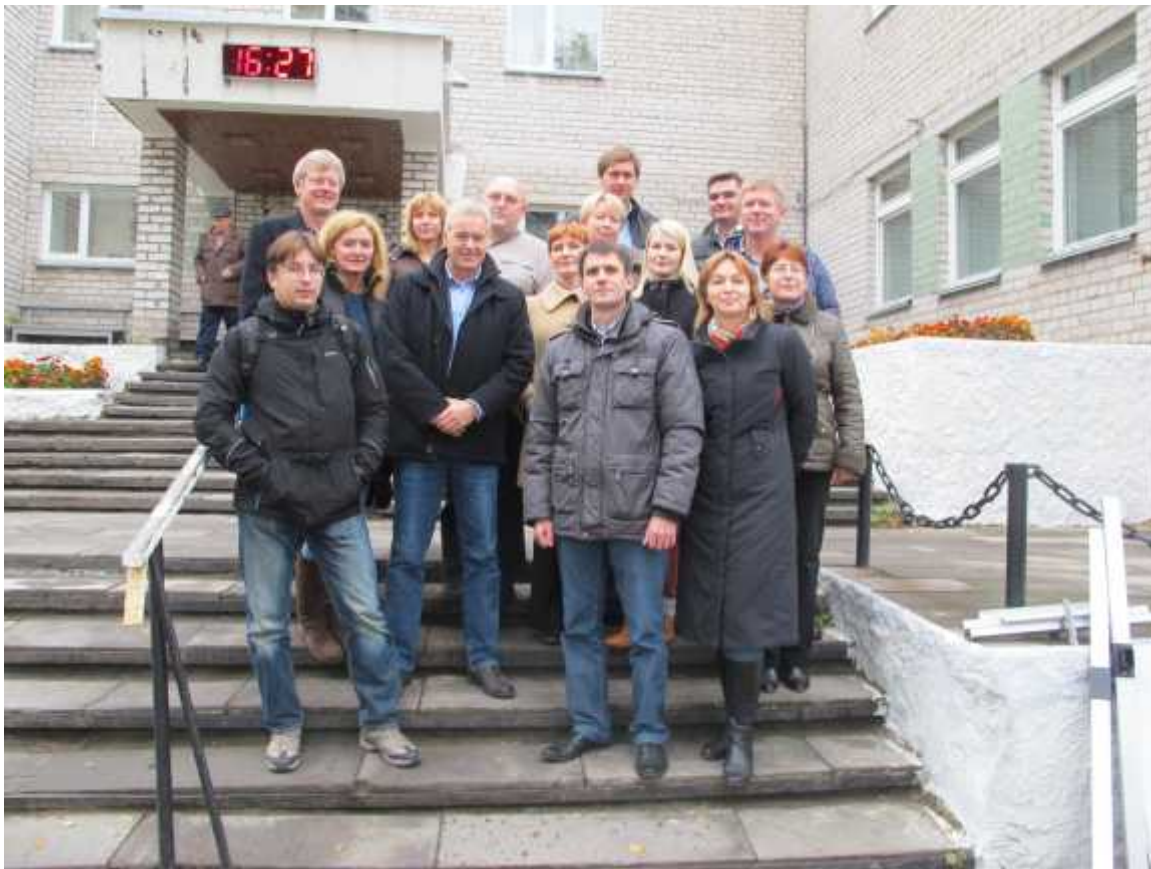
Seminar in Arkhangelsk, September 2012.

Phase I (2008 – 2011) and phase II (2011 – 2014)