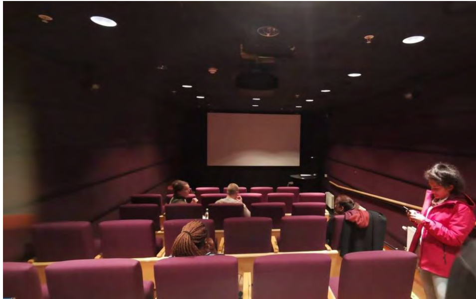
Waiting for the movie to start.

TODOS Monthly Social Gathering - The monthly social gathering was held at Storgata Camping and 20 people attended to drink beer and make new friends. This was our first monthly social gathering since February because of COVID-19. The event was held on September 16.