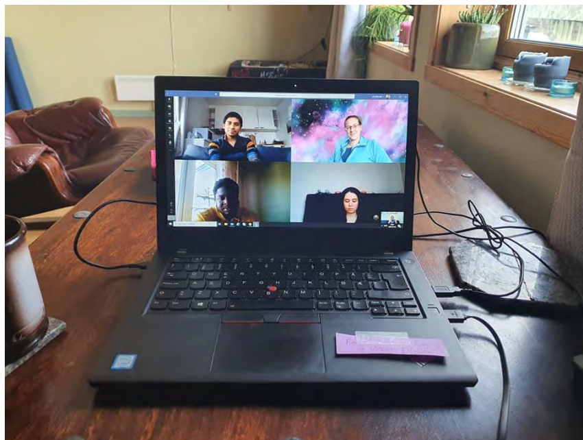
TODOS Board Meeting in the middle of the pandemic.

Communication with Membership and Expanding Advocacy - This work from April continued through May as government and university restrictions were eased and concerns were raised from PhD and Postdocs who were concerned how they could successfully finish their course of work and study. Through this TODOS continues to advocate on behalf of its members to receive clear messaging from the university administration about necessary contract extensions.