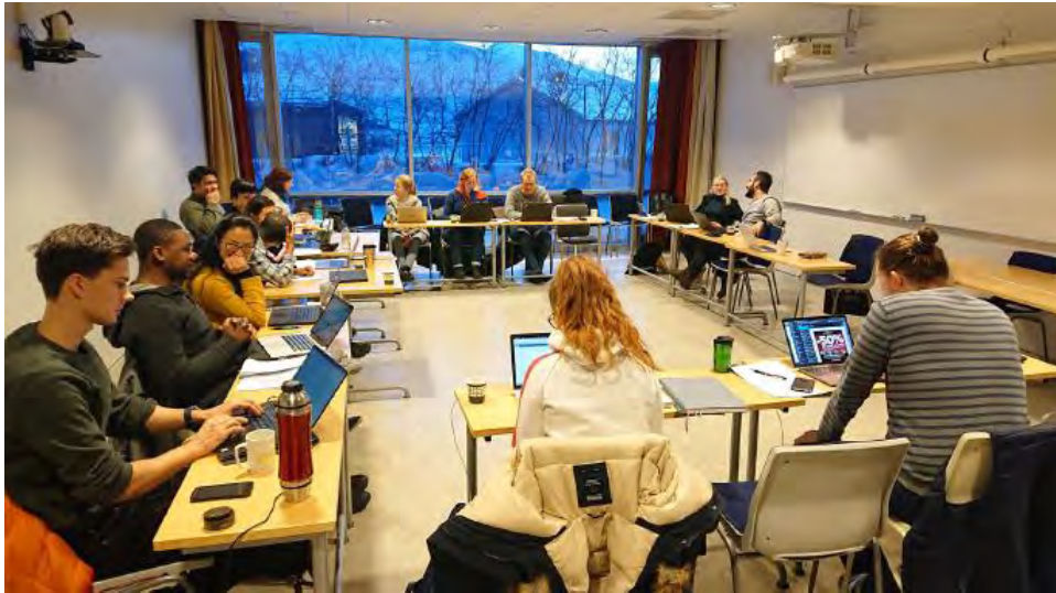
Shut up and Write Session, December 9 th , 2019

Life After the PhD, Part 2 - This series was designed as a collaboration between TODOS and the High North Academy, in response to feedback that PhD and Postdoctoral fellows needed guidance in developing their professional skills. The first part of this series was hosted in October and on December 10th saw the much-anticipated Part 2. The second workshop was titled, “Building Your CV - Toward Your Dream Job!” 22 people registered for the event.