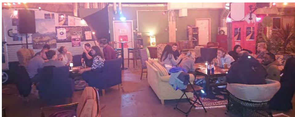
TODOS Social – September 16

TODOS Monthly Social Gathering - The monthly social gathering was held at Storgata Camping and 20 people attended to drink beer and make new friends. This was our first monthly social gathering since February because of COVID-19. The event was held on September 16.