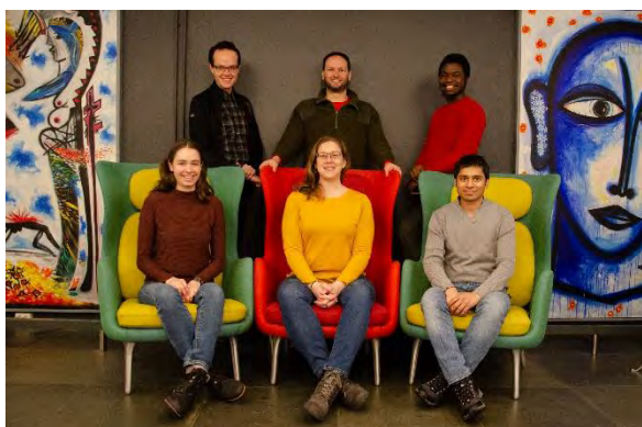
TODOS Board, Spring 2020

TODOS Board members are part of different councils and committees and participate in different meetings and events. TODOS strives to have representatives on all major university committees. In addition to that, the TODOS Board also organizes its own meetings to identify needs and concerns, plan social and academic events, generate new ideas, and share information. TODOS is also constantly receiving feedback from its members and is always working to improve the working conditions at the university. Our network of contact persons throughout the institution is used to achieve the necessary changes.