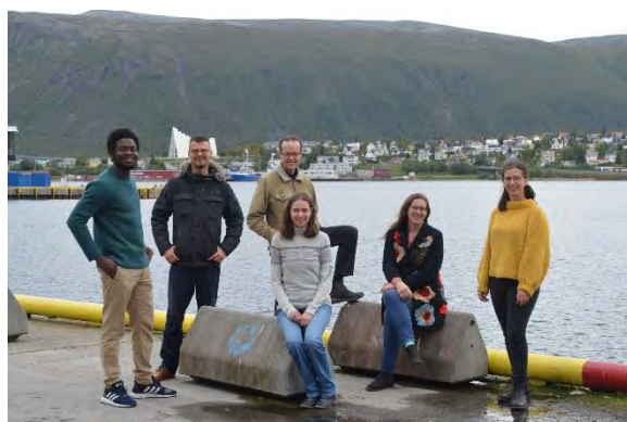
TODOS Board, Fall 2020